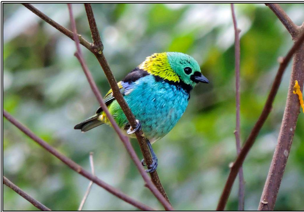
Green-headed Tanager

Tour duration – 2 days / 1 night Starting: August 13 th Ending: August 14 th