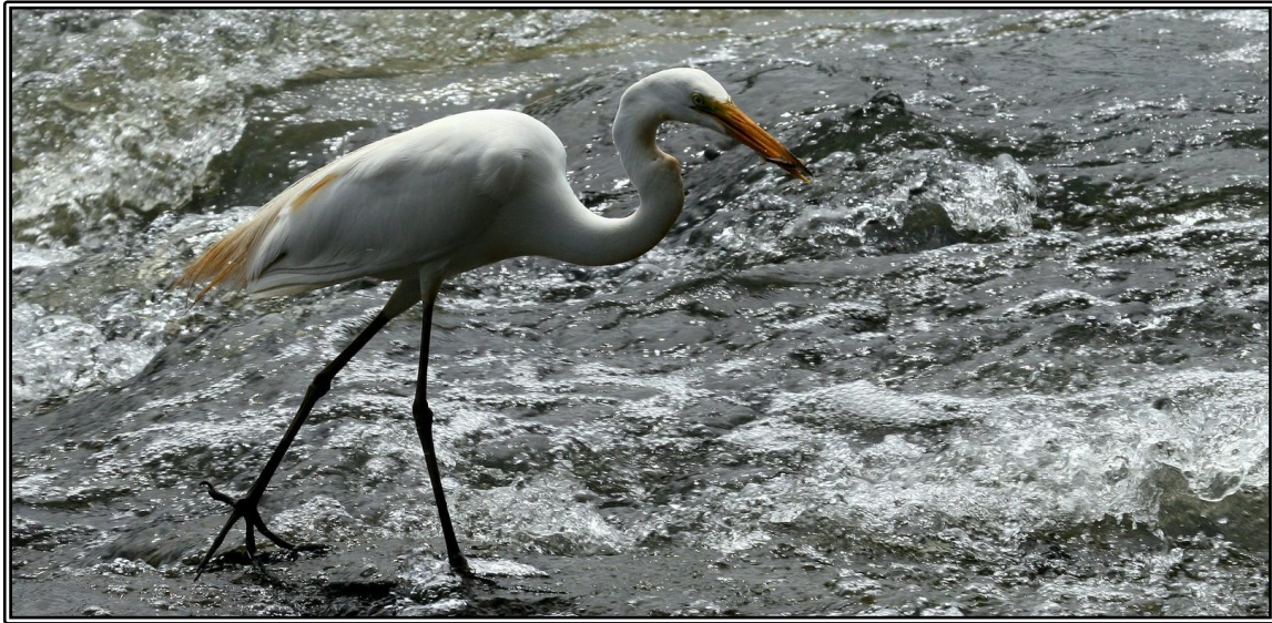
Great Egret

Travel and Medical Insurance: Trogon Tours highly recommends that clients purchase a travel and medical insurance to cover for unexpected cancellations at short notice, and for possible medical emergencies while on tour.